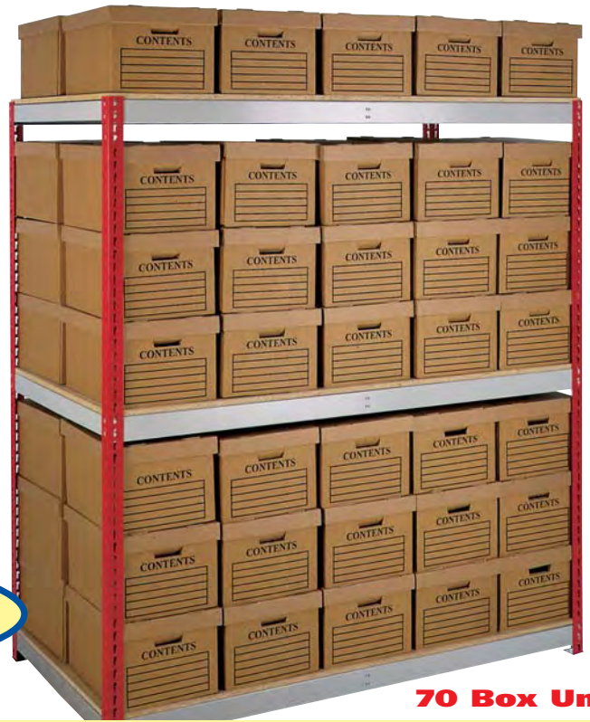
70 Box Unit