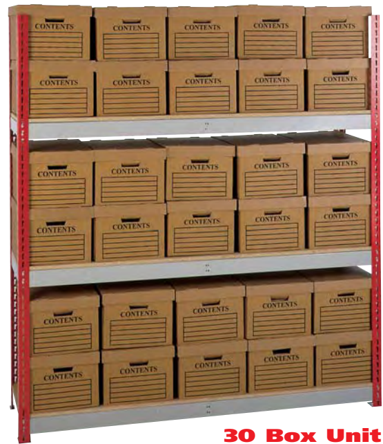
30 Box Unit