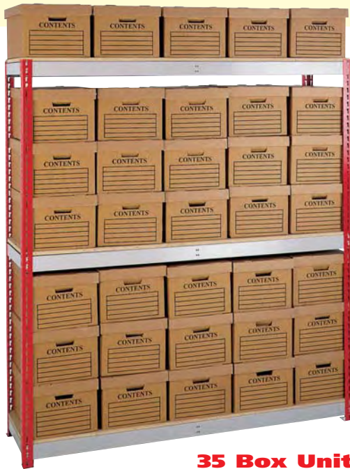
35 Box Unit